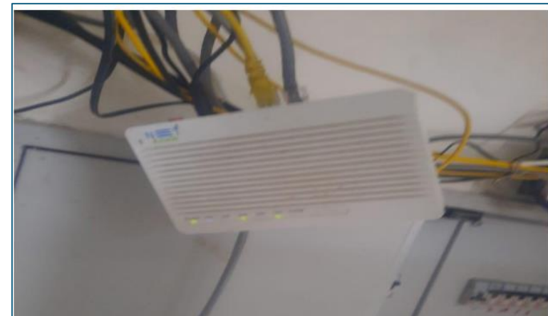
WIFI ACCESS POINT